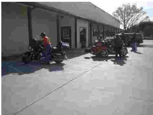
Lunch at Granzella's in Williams