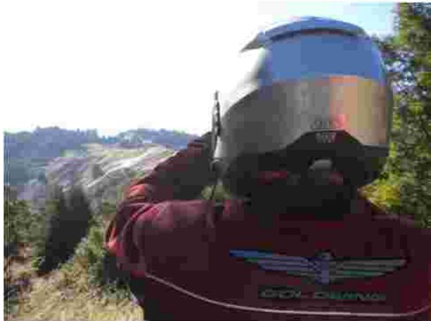
Ron Using the Stars to Find Our Location